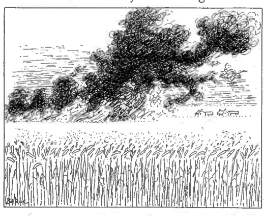
The above is from a photograph of 640 acres of standing grain which was deliber-ately burnt in Kansas, U.S.A.

2. Millions of people in this country, and also in other countries living drab, penurious lives, many under-nourished, and some even starving. There are three ways of dealing with this